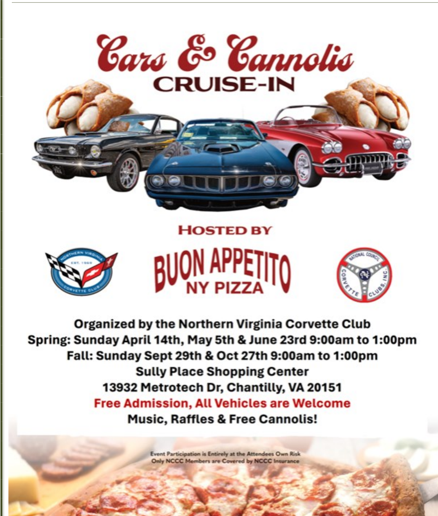
of a 1965 Ford Mustang Fastback Coupe at a local car show 1971 Physical Barracoda Coupertible at a local car show